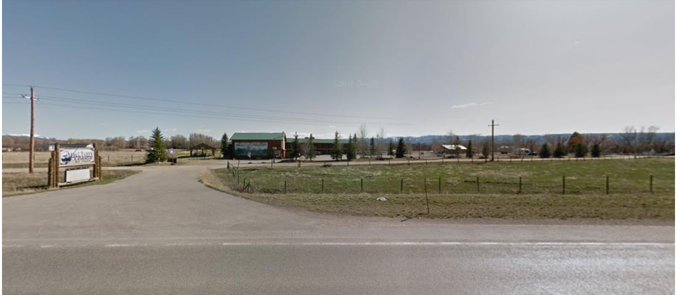
View from Hwy 33.