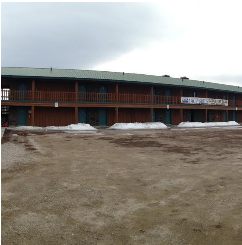
Parking lot.